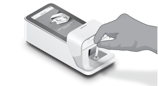
Sample application using a transfer tube

You may use a non-anticoagulated Transfer Tube to transfer the capillary sample from the finger stick to the Sample Application Area of the Test Strip. To do this follow the procedure above for collecting a capillary blood sample from a finger stick. Use the Transfer Tube by placing it into the blood droplet on the finger, and the blood should quickly move into the tube. Then hold the Transfer Tube over the Sample Application Area of the Test Strip and dispense the sample. This should be enough just to fill the Sample Application Area. Take care not to introduce air bubbles into the sample. When the sample is detected the Instrument will sound (if sounds are enabled) and a confirmation message will be displayed. The touch-screen of the LumiraDx Instrument will request the user to close the door. Dispose of the Transfer Tube in the appropriate clinical waste. Follow instructions from step 4.